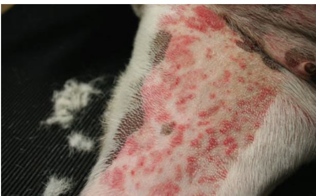
Erythematous macules