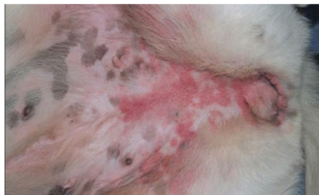
Erythematous macules