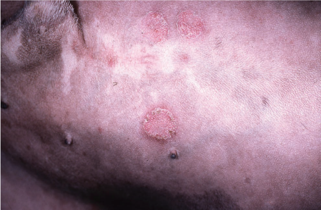
Epidermal collarette

The skin can only respond to injury in a limited number of ways. These pathological changes (or lesions) can be indicative of the type of disease process occurring.