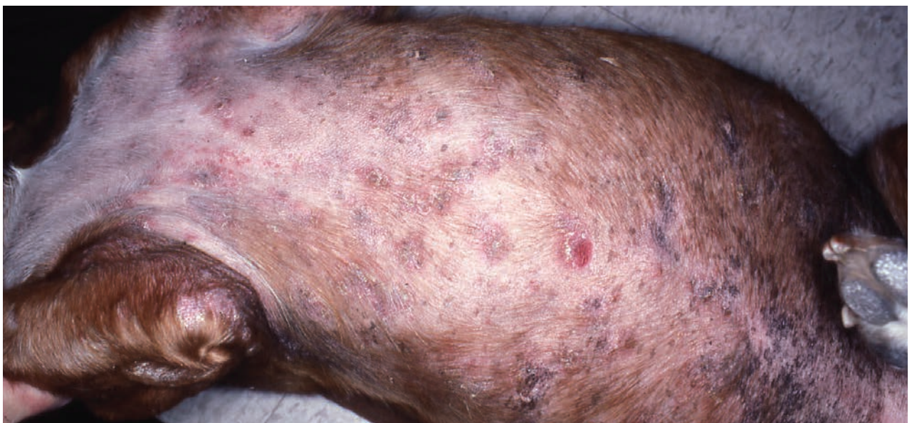
Crusted papules and pustules