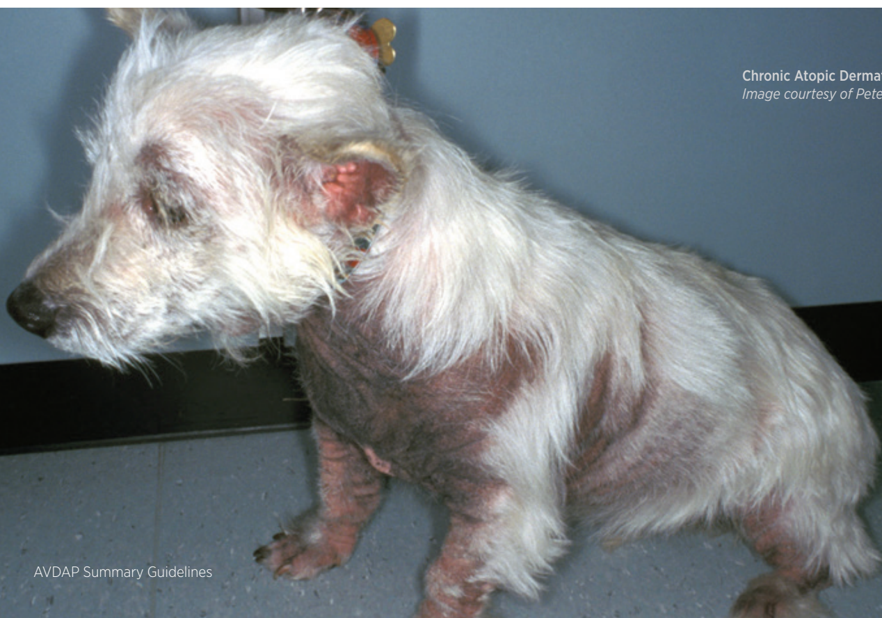
Chronic Atopic Dermatitis